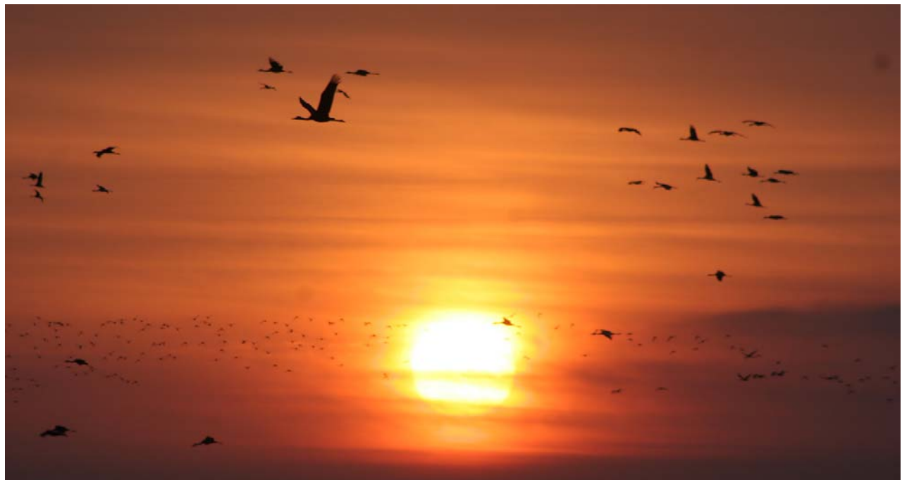
Hooded and White-naped Cranes, Kyushu