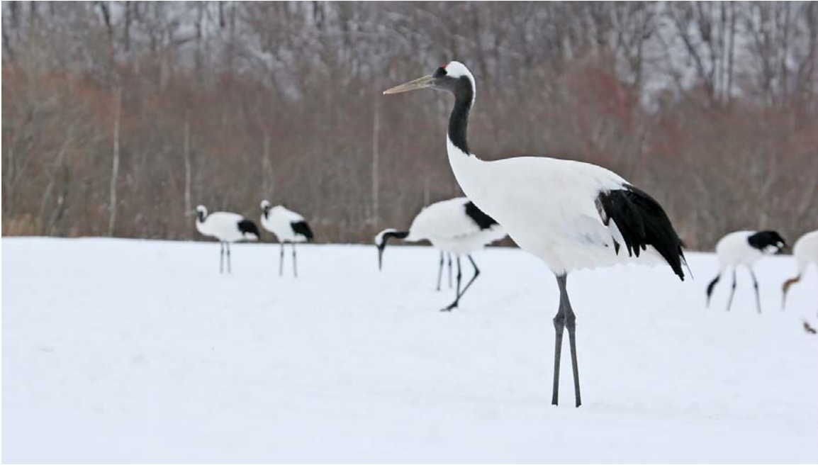
Red-crowned Crane, Hokkaido

As we headed east we found a nice flock of 55 Mandarin on a newly constructed dam before settling in Hyuga for an overnight stay.