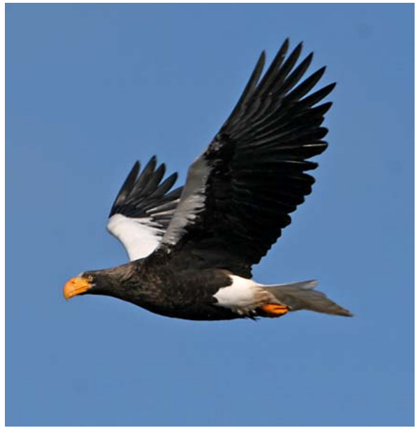
Blakiston's Fish Owl and Steller's Sea Eagle, Hokkaido