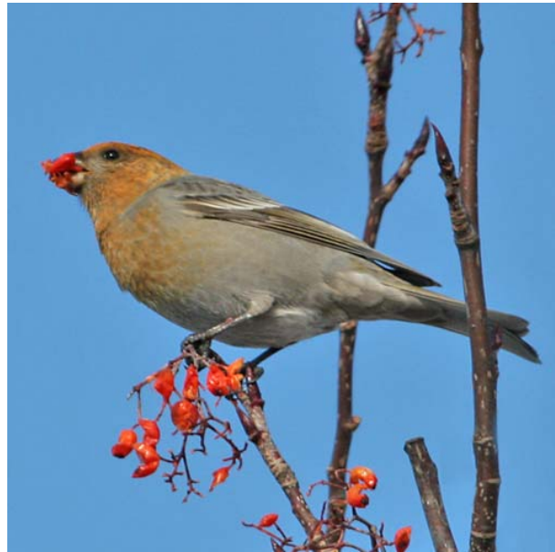
Eurasian Nuthatch ssp. asiatica , and Pine Grosbeak, Hokkaido