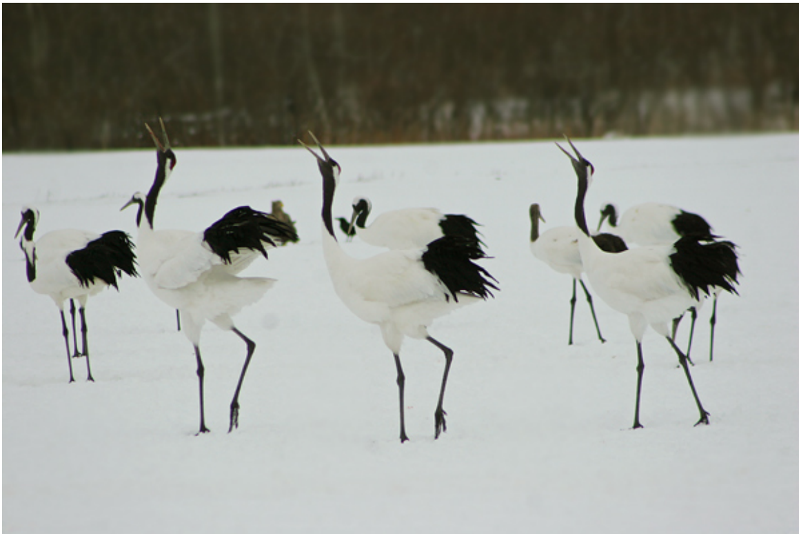
Red-crowned Crane, Hokkaido