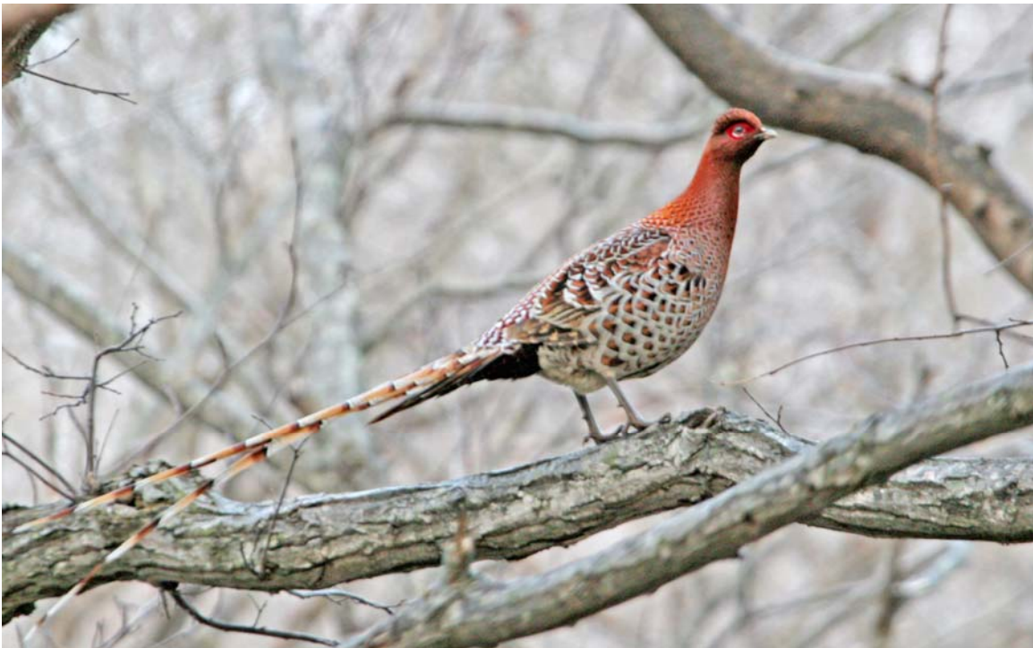
Copper Pheasant, Karuizawa, Honshu