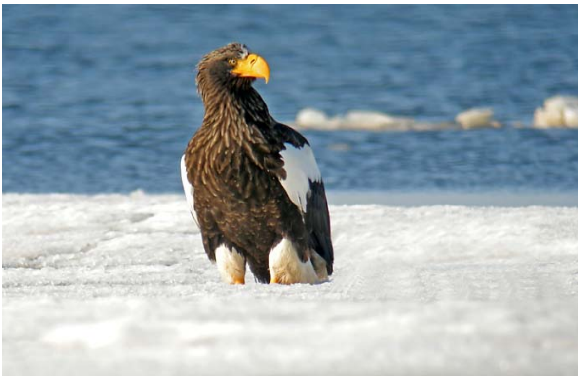
Steller's Sea Eagle, Hokkaido

Snow on Hokkaido in the north of Japan the next morning causes the cancellation of our planned flight but some rapid rearranging sent us to a nearby town and we arrive at our minshuku on the shore of Lake Furen as planned having enjoyed our first Steller's Sea Eagles en route.