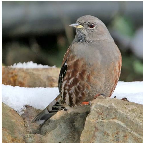
Meadow Bunting, and Alpine Accentor, Karuizawa, Honshu

At dusk on the first day we could hear the calls of an Ural Owl but it was very distant and after enjoying our first Japanese Giant Flying Squirrel in the spotlight we retired for dinner before again returning to the forest. Employing a different technique, we drove slowly around the quiet road while spotlighting from the vehicle, and this worked perfectly when a huge pallid Ural Owl soon filled the spotlight.