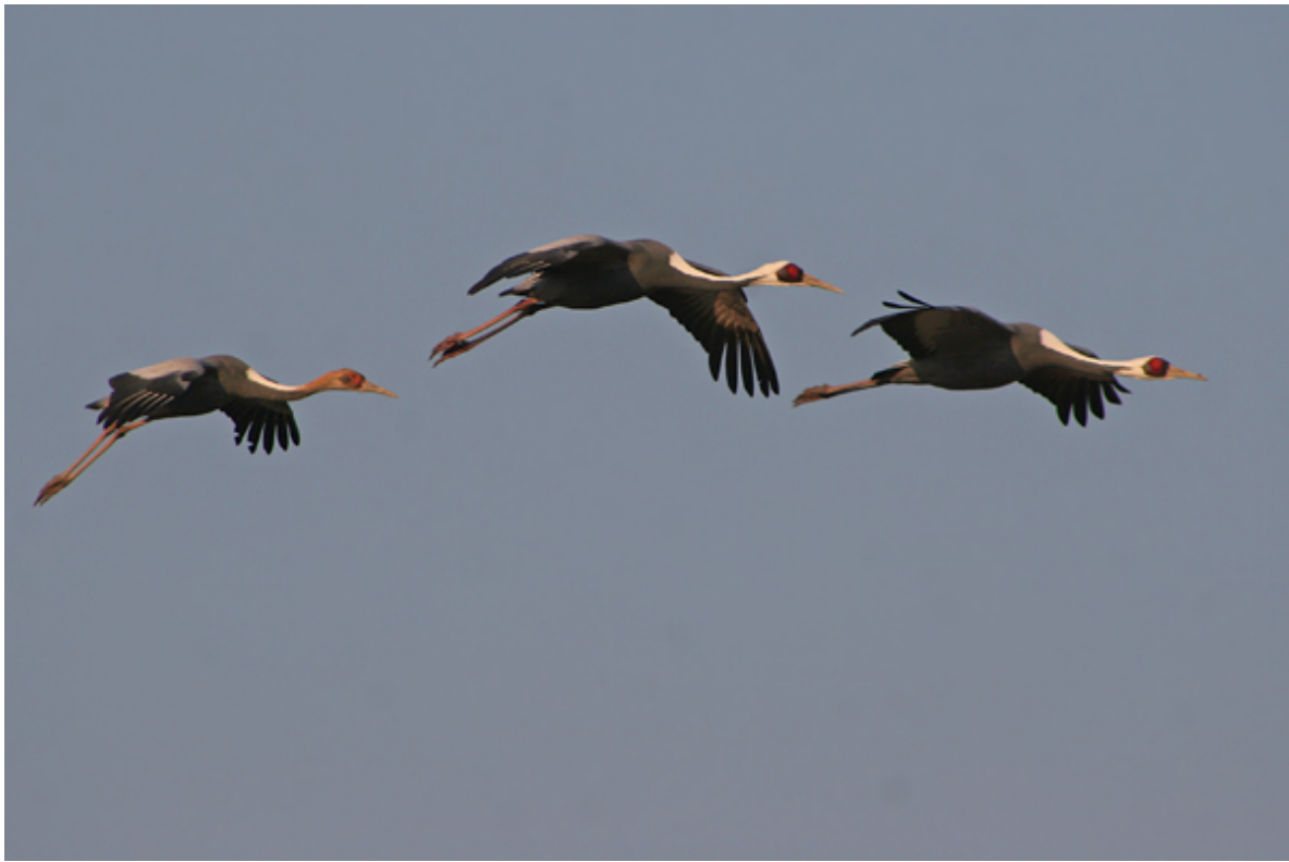
White-naped Crane, Kyushu