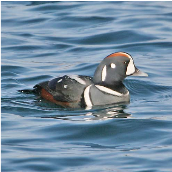
Harlequin Duck, and Brunnich's Guillemot, Hokkaido