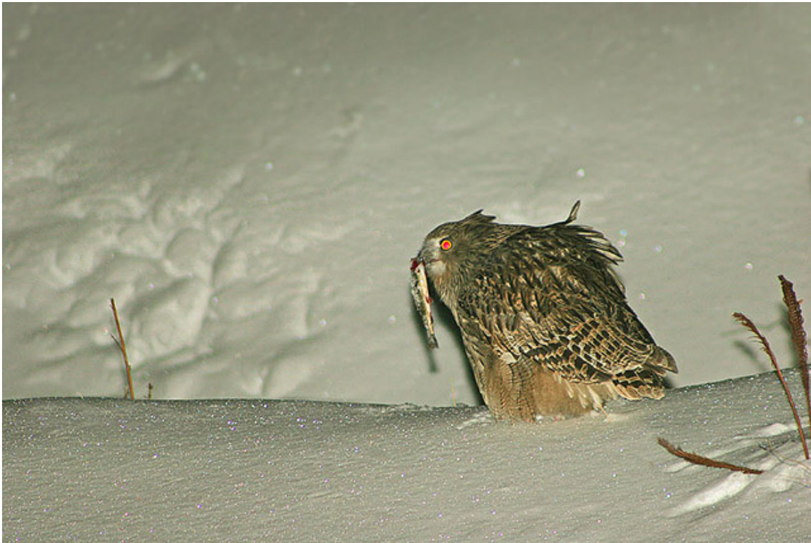
Blakiston's Fish Owl, Hokkaido