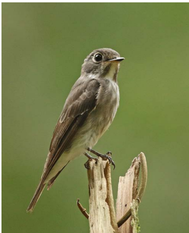
Red-naped Trogon and Dark-sided Flycatcher