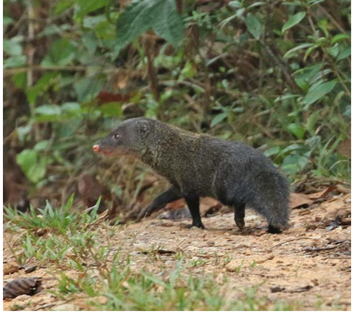
Blue-winged Leafbird and Short-tailed Mongoose