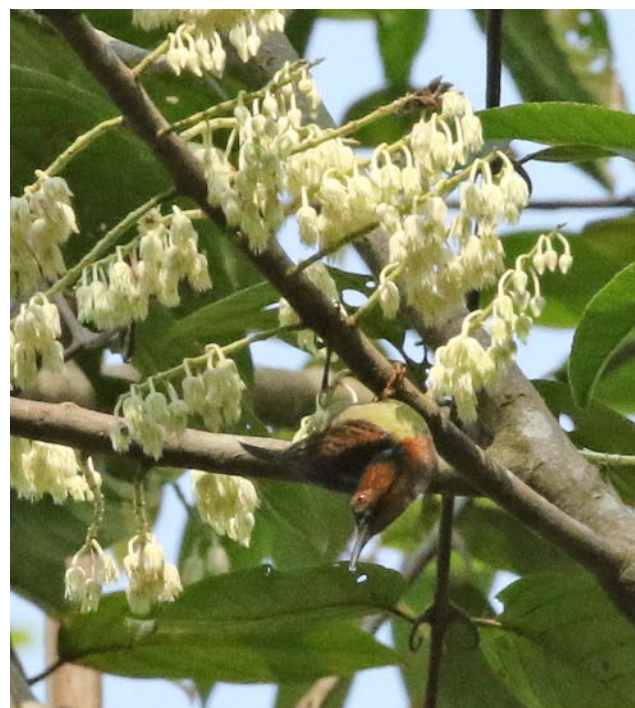
Red-bearded Bee-eater and Red-throated Sunbird