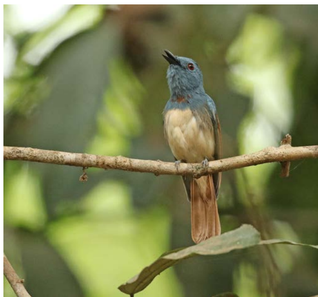
Fluffy-backed Tit Babbler and Rufous-winged Philentoma

The next day we found our way to a less frequented part of the forest, and were soon rewarded by a good selection of birds. Crimson-breasted Flowerpeckers and Blue-winged Leafbirds fed in the trailside scrub, while Red-crowned Barbet, Black-thighed Falconet and Little Green Pigeons were seen in the taller trees. Two more Rail-babblers were encountered, although views were much more difficult than on our first day. We surprised a Short-tailed Mongoose foraging along the trail in front of us, and avian highlights included two more lifers for John and Mike - a stunning Red-bearded Bee-eater and a no less resplendent Red-throated Sunbird feeding in a flowering tree. Maroon Woodpecker, Raffles's Malkohas and Grey-rumped Treeswift were other birds of note from the morning.