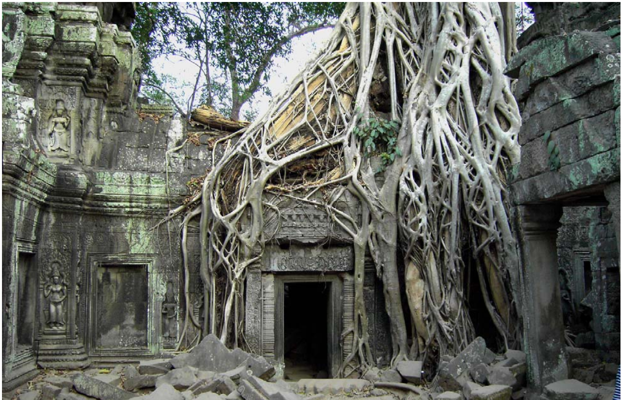
Ta Phrom Temple, Angkor Wat