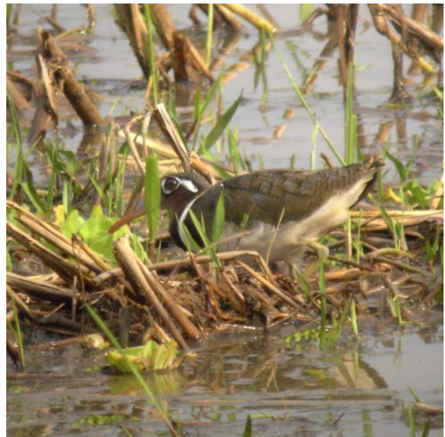
Greater Painted-Snipe, Ang Trapeang Thmor

Our first full day in the field saw us head west to the large Khmer Rouge-built reservoir of Ang Trapeang Thmor, it took most of the morning before we eventually reached the water body due to our frequent birding stops, White-shouldered Starlings and Yellow-breasted Buntings were noted in several small flocks, Eastern Marsh and fine male Pied Harrier gracefully quartered the recently ploughed fields, a Greater Spotted Eagle flew overhead, Red-throated Pipits flocked on the road around the vehicles, Plain-backed Sparrows chirped continually in the background and a singing Oriental Skylark was eventually picked-out as a mere speck in the sky before diving-bombing to the ground.