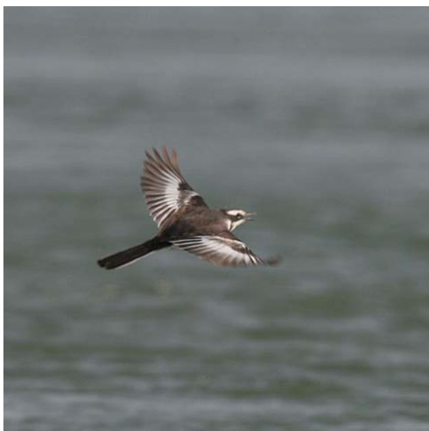
Mekong Wagtail, Kratie

After all this it was time to make our way back to Phnom Penh after some final tasty dishes of Cambodia's much underrated local cuisine in a riverside restaurant in Kampot, I doubt I was the only one to actually put ON weight during this tour! This put an end to a most enjoyable tour in which we saw a total of 271 species with an additional 15 heard only.