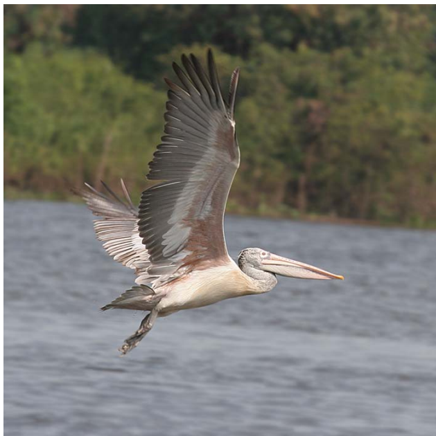
Spot-billed Pelican, Prek Toal

and Oriental Darter loafed around the fishing pens. Little did we realise that upon entering Prek Toal we were actually entering the heart of darkness rather than Asia's prime water-bird sanctuary. Needless to say, the rest of the morning is best forgotten but involved an extensive, shrinking channel system, trapped motorboat, a small unpaddlable paddle boat and the leader up to his neck in water, literally! The afternoon was considerable better though, as we reached the precariously simple platform atop a small tree overlooking part of the water-bird colony and a fine pair of Milky Stork with their recently hatched young were quickly located as we enjoyed our lunch onboard under the shade. Both hulking Greater and Lesser Adjutants remained distant until a Greater Adjutant flew low overhead enabling us to admire its grotesque form in all its beauty. On our rather more relaxed return we were able to admire the spectacle of hundreds of Painted Stork, Spot-billed pelican, Asian Openbill and Oriental Darter spiralling overhead. Navigating through the extensive channel system pulled in a few surprises, migrant Chestnut-winged and Oriental Cuckoos, Yellow Bittern, Rufous Woodpecker and Racket-tailed Treepie.