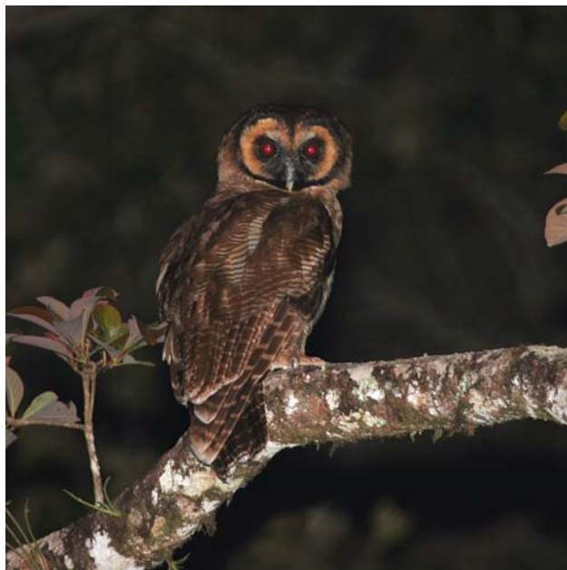
Brown Wood-Owl, Bokor National Park

For information regarding our Oriental Bird Club fund-raising tour to Cambodia in 2008 please click here . Alternatively please contact us at info@birdtourasia.com regarding organising a custom tour to Cambodia.