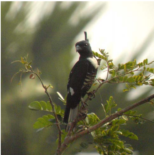
Black Baza, Angkor Wat