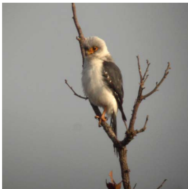
White-rumped Falcon, male, Tmat Boey