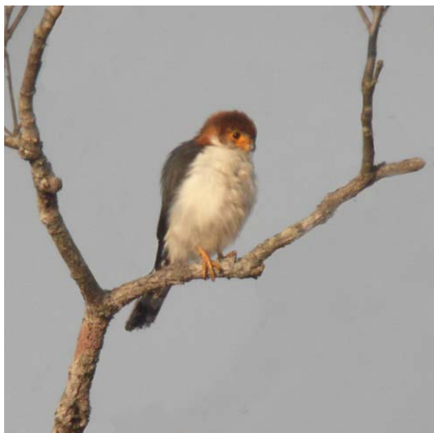
White-rumped Falcon, female, Tmat Boey

The following morning was rather laid-back as we took a small boat out onto the Mekong in search of the recently described Mekong Wagtail. We found a pair of them chasing after each other, singing and 'doing their thing' scrambling in amongst the bushes. On our return to shore we went in hot pursuit of the Irawaddy Dolphins and, via a minor detour to retrieve Graeme's floating OBC cap, we had several smart views as the wind pushed them further out of the water than usual. The rest of the day was spent driving south to the small town of Kampot for an overnight stop and a look at the nearby Salt-pans. A small flock of Long-toed Stints with a single Temminck's Stint kept us entertained and as we ate breakfast Germain's Swiftlet was a write-in along with Pacific and House Swifts.