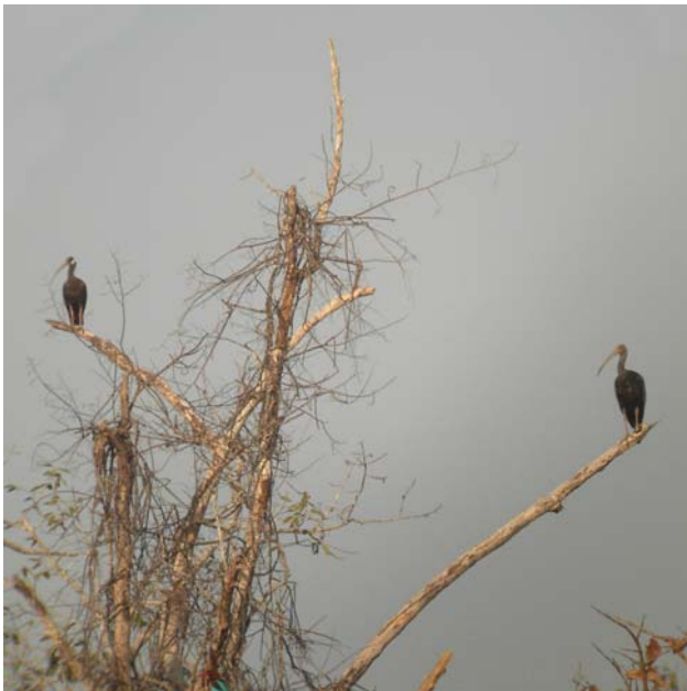
White-shouldered & Giant Ibis, Tmat Boey