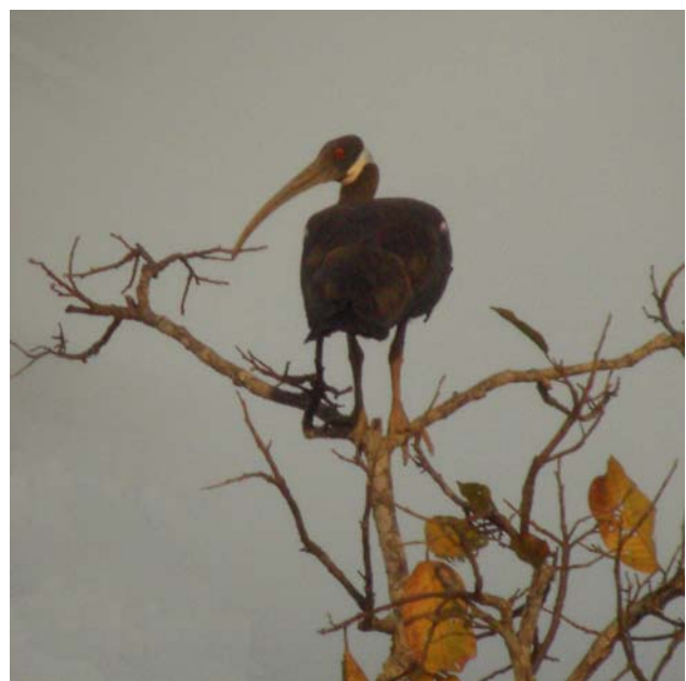
White-shouldered Ibis, Tmat Boey

Our early exploits with the night-birds left us wanting for more so a couple more outings into the woods at night eventually produced the much hoped for elusive Oriental Scops-Owl, this resident form would appear a good split from other asian sub-species differing, in habitat and vocalisations. Though the pair of Collared Scops-Owls feeding outside our accommodation were a little easier for the little-sleepers amongst us, to complete our owl-haul, both Spotted Owlet and a rather sleepy looking Brown Fish-Owl were discovered during the daytime. Our final 'biggy' proved a little more difficult to find until our final morning when the distinctive (to our local guide at least) early morning call of a male White-rumped Falcon was heard close-by, within minutes we were scoping a fine male White-rumped Falcon perched atop a nearby tree, though the bird soon disappeared we managed to relocate it sitting next to a female and before long watched in awe as the pair attempted to continue the species existence at Tmat Boey in explicit detail despite the females rather bland expression after proceedings! Once the excitement was over we bid farewell to the wonderful wilderness and people and headed south to the town of Kompong Thom and its surrounding grasslands.