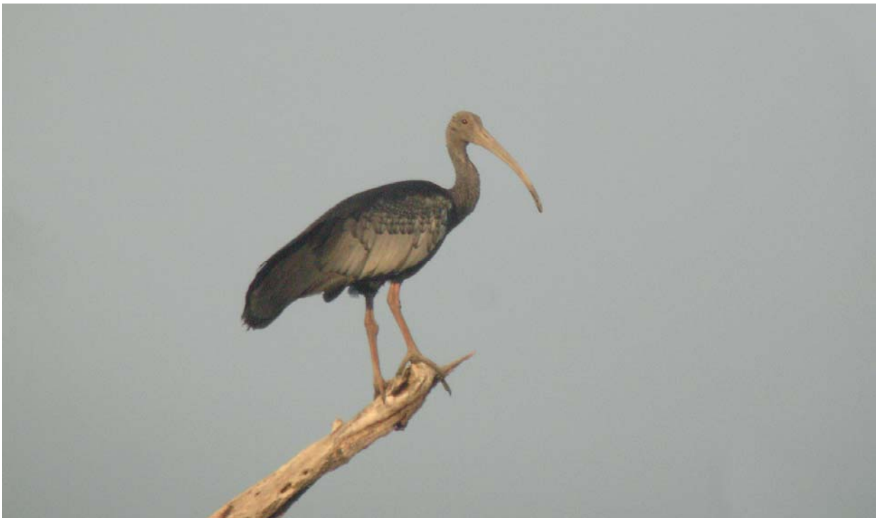
Giant Ibis, Tmat Boey